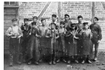
Gunnebo Industries chain smiths in the 1920's

Over the years Gunnebo Industries have lead the development in the industry in a number of ways. For an example they were one of the first in the world, in 1906, to use electric welding for chain manufacturing, which made the chain stronger and more reliable and soon became the standard procedure world-wide.