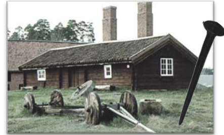
The house where the hammer-smithy was located in 1764